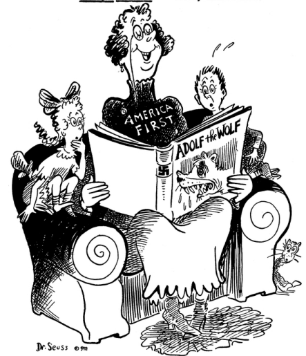
Seuss, Dr., PM Magazine, October 1, 1941

... and the Wolf chewed up the children and spit out their bones ... But those were Foreign Children and it really didn't matter."