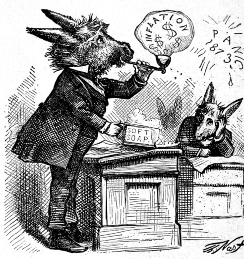
Thomas Nast, titled "Fine-Ass Committee," a donkey stands in for a Democratic congressman blowing financial bubbles, after the Panic of 1873

carried the torch into the Cold War. "McCarthyism," a term that defined the 1950s, was coined in one of his comics. He spent the better part of the mid-20th century dominating newspapers with critiques of the Red Scare, the Vietnam War, the Nixon administration, and more. A true foil to Thomas Nast, Herblock's vitriol was returned by multiple presidents in turn; Lyndon B. Johnson refused to give him the Presidential Medal of Freedom that he was nominated for after seeing a satirical cartoon of him and his handling of Vietnam a day earlier, and his depiction of Richard Nixon, then a Vice President, crawling out of a sewer got him added to the future resignee's infamous "enemies list."